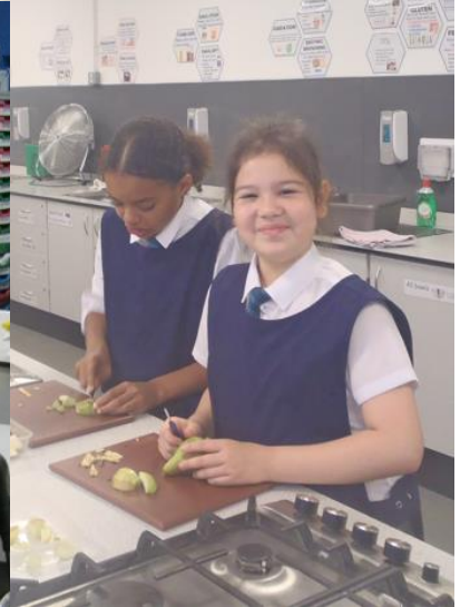
Great learning through politeness, honesty and hard work